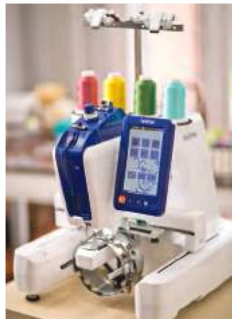
Cap frame shown is an additional purchase.

More creation, less work - the bobbin sensor will tell you when the thread is broken or has run out. While anytime access lets you change the lower bobbin without removing your project.