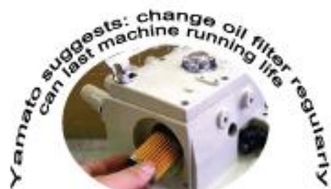
Yamato suggests: change oil filter regularly can last machine running life equipped with " Oil Filter "

Precise reasonable design, high quality parts ensure CZ series for quick acceleration, low noise and little vibration. Thus, the fatigue of operators is minimized. And instable operation and injuries are consumedly decreased. Moreover, low noise/little vibration proves less abrasion of the machine, which means longer running life.